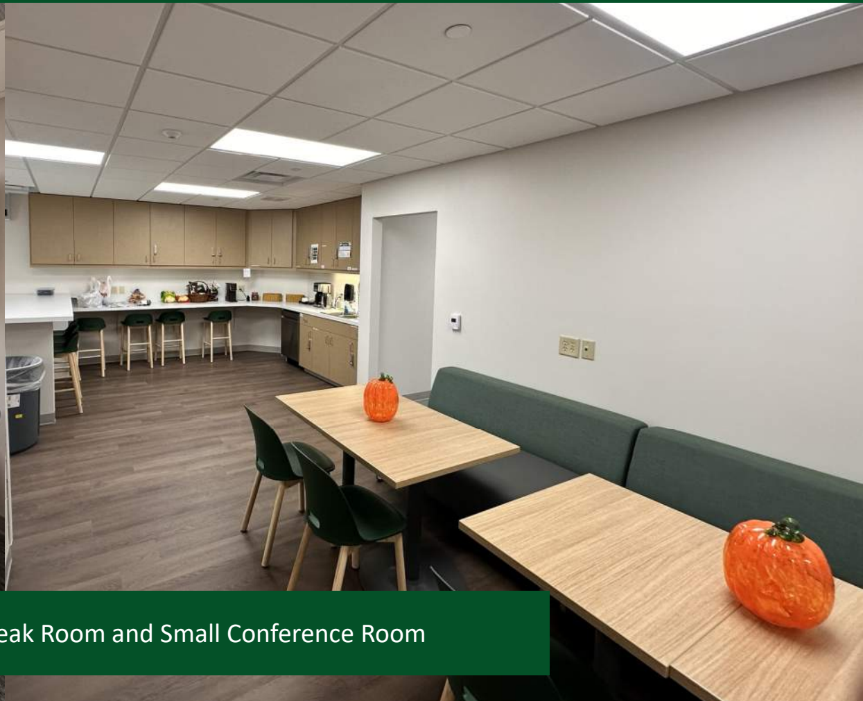
Main Level: Break Room and Small Conference Room