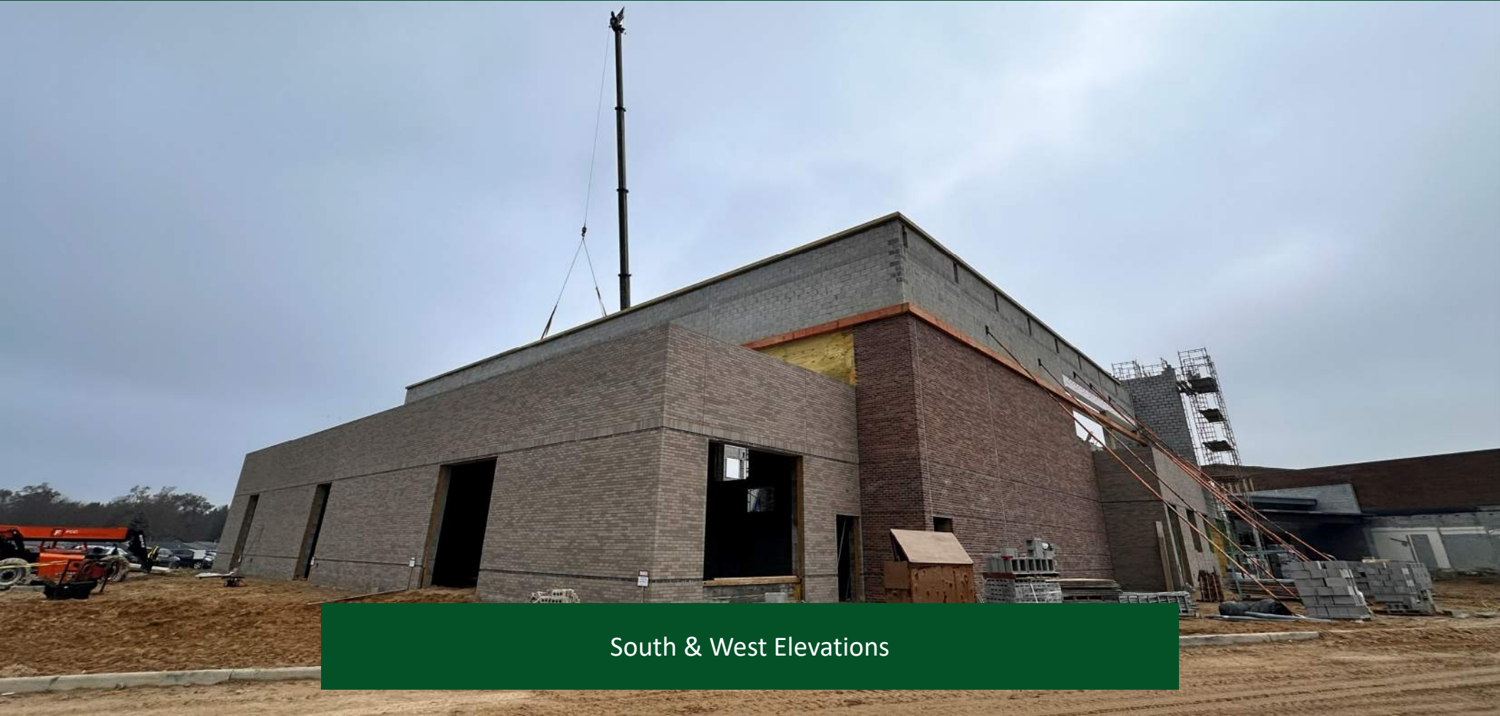
South & West Elevations