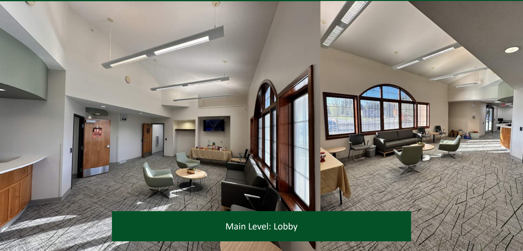
Main Level: Lobby