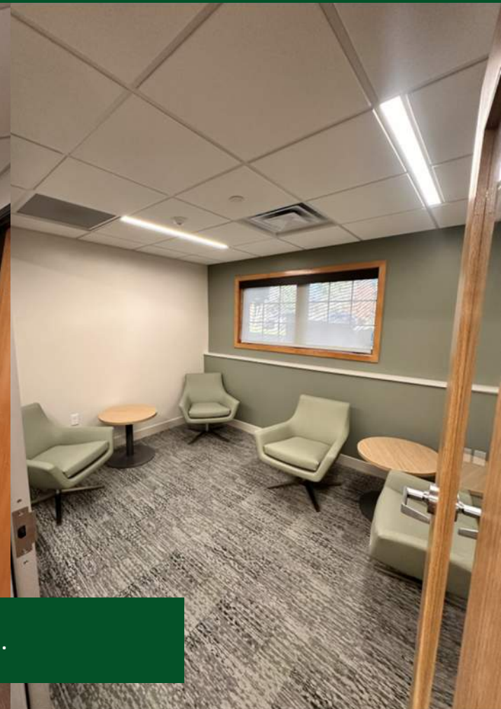
Lower Level: Restrooms and Lounge spaces.