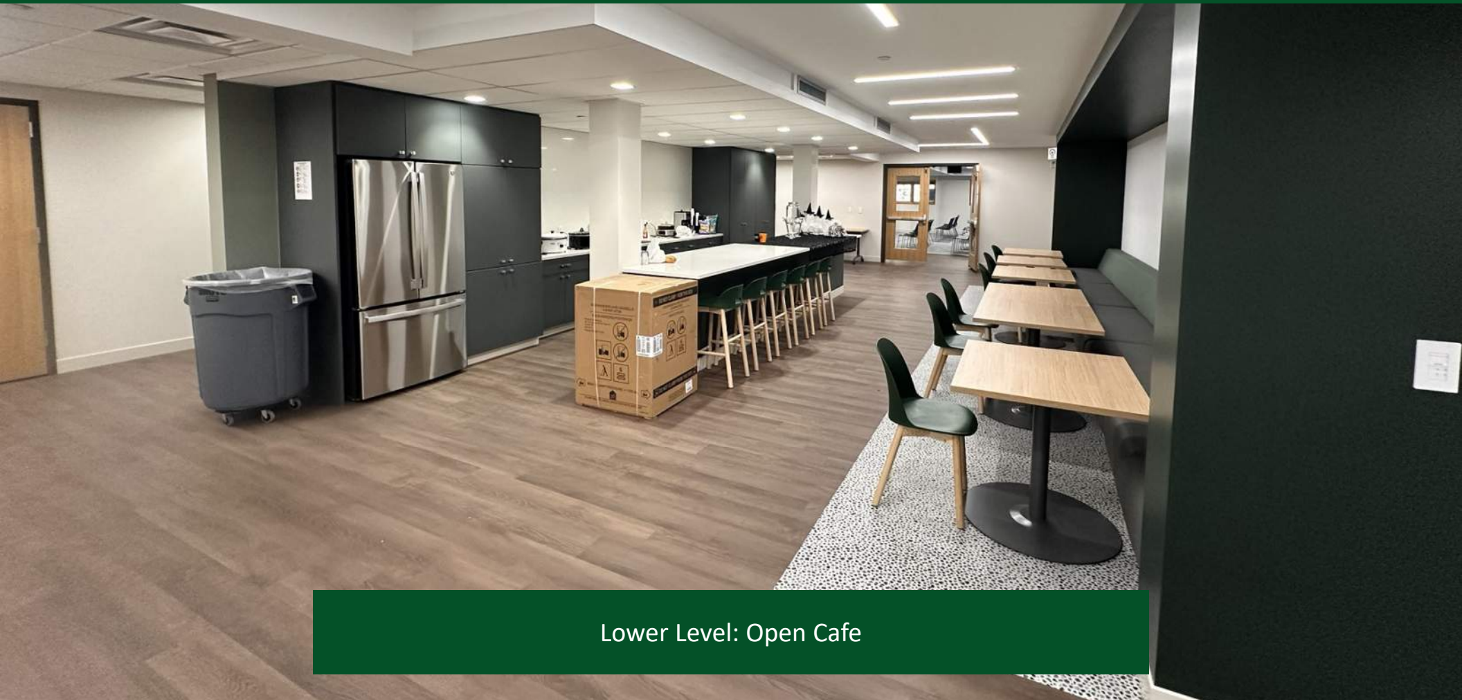
Lower Level: Open Cafe