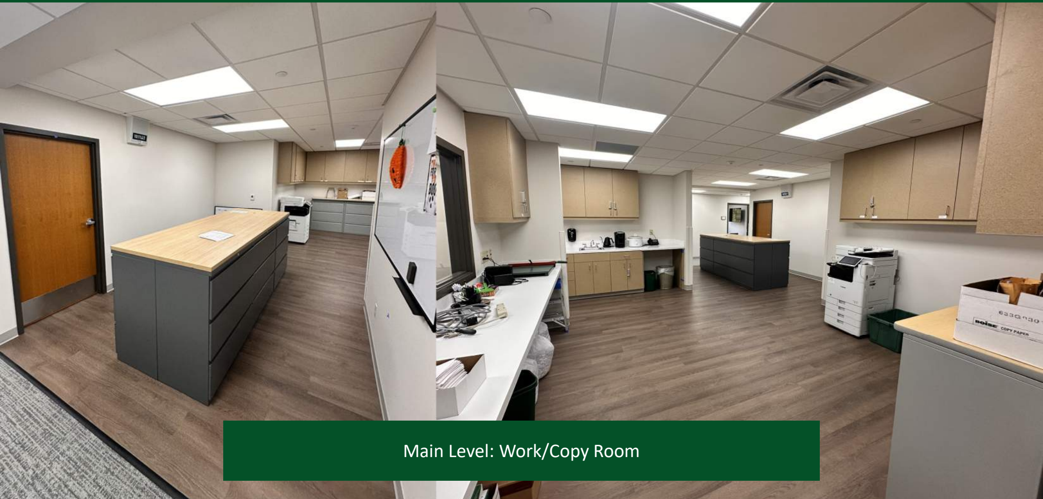
Main Level: Work/Copy Room