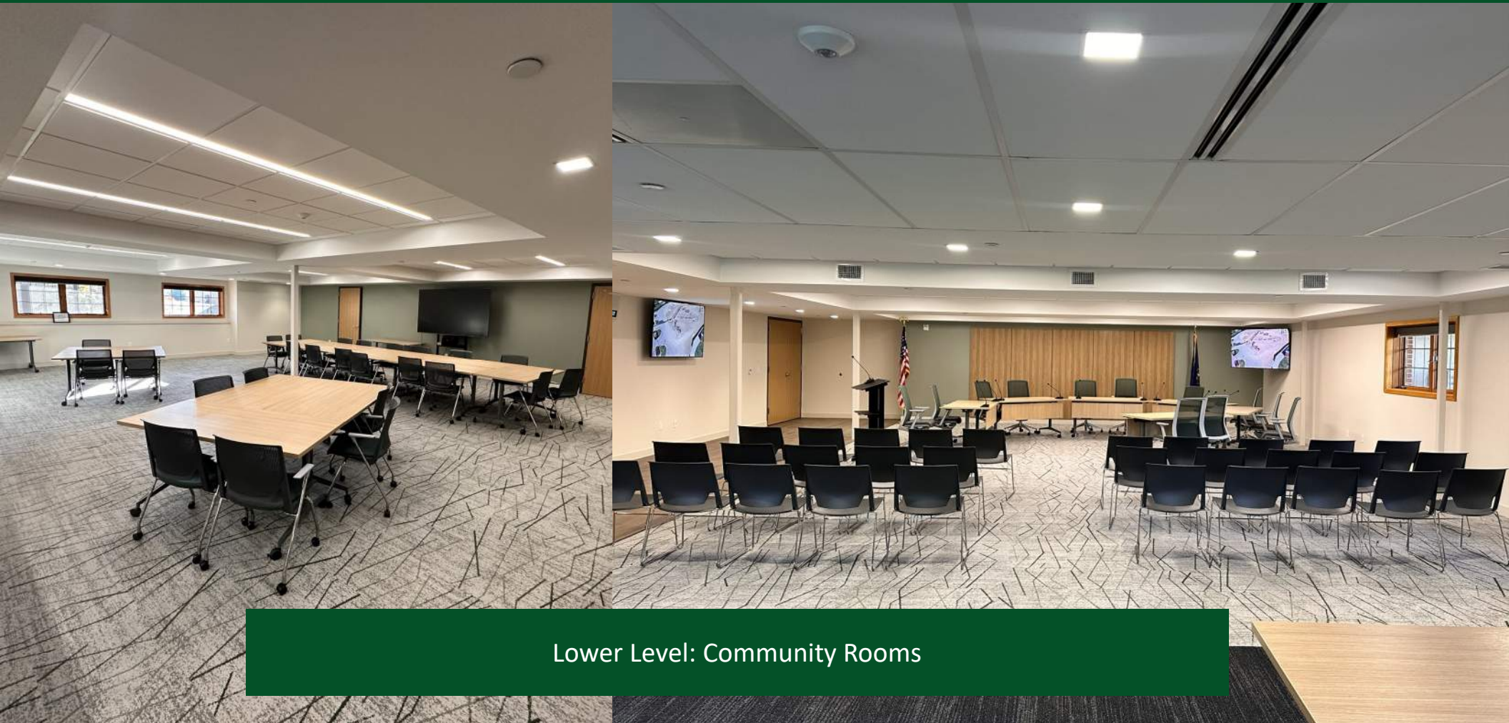
Lower Level: Community Rooms