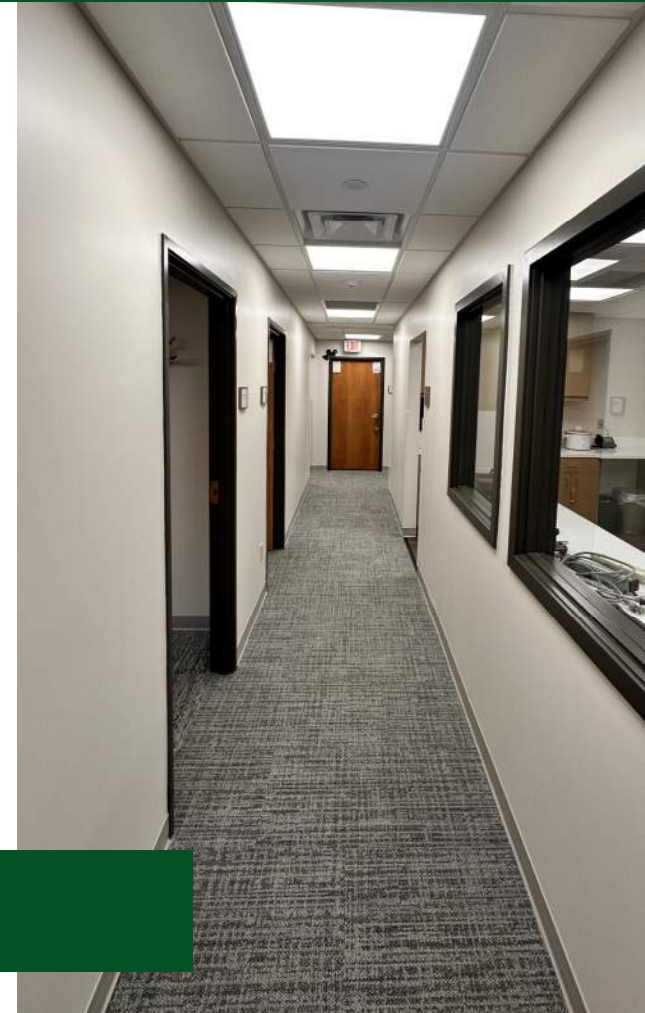
Main Level: Corridors and Restrooms